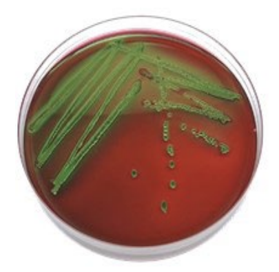
Fig. 1. Bacterial colonies growing on EMBA media glow metallic green metachromatic.

A total of 97 E. coli (53%) from 135 bat rectal swab samples were successfully isolated and identified. E. coli bacteria on EMBA media showed a metallic green metachromatic luster (Figure 1), in Gram stain test results showed a rod-shaped morphology and a reddish-pink color (Figure 2). The IMViC biochemical test results showed the presence of a pink ring, no color change in the MR medium after the methyl red reagent was dropped and there was no color change in the VP medium when the alpha naphthol reagent and 40% KOH were dropped, indicating positive E. coli . The green color of citrate media indicates a positive result for E. coli .