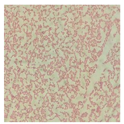
Fig. 2. The morphology of the bacteria is rod-shaped and pink-reddish in color

Bacteria identified as positive for E. coli were tested for sensitivity (Figure 3) with the results showing that 41 samples were still sensitive to all the antibiotics tested, 56 samples were resistant. Various resistances were shown by the test samples, where 437 samples (38.1%) were resistant to the antibiotic azithromycin (AZM), 24 samples (24.7%) of amoxicillin (AML), 24 samples (24.7%) of tetracycline (TE), sulfamethoxazole-trimethoprim (SXT) 24 samples (24.7%), ciprofloxacine (CIP) 14 samples (14.4%), gentamicin (CN) 1 sample (1%), and for cefotaxime (CTX) 0 samples experienced resistance (0%).