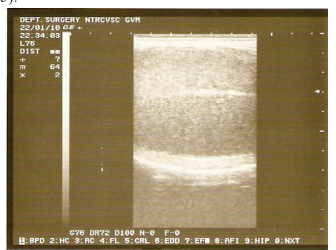
Fig. 1. Ultrasonogram of testis showing the uniform moderate echogenic parynchyma with hyperechoic mediastinum at middle on longitudinal plane

Transrectal ultrasonography of the Ongole breeding bulls revealed the prostrate body as a hyperechoic area located dorsal to the neck of the bladder. The ampullae which are located on the neck of the bladder appeared as two dorsal lines with non-echogenic linear lumen, while the glandular lining appeared as moderately echogenic line followed by hyperechogenic muscular wall (Fig. 5).