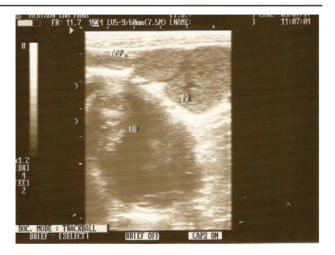
Fig. 5. Trans- rectal ultrasonogram revealing hyperechoic prostrate (PR),non echoic linear lumen of ampulla along with hyperechoic muscular wall (AMP). Note the anechoic urinary bladder (UB) and its relation.

Seminal vesicles which are meaty lobulated glands with central dilatations were examined lateral to the ampulla, above the neck of the bladder which appeared as irregular shaped isoechoic lobes of glandular tissue separated by hypoechoic regions (Fig 6).