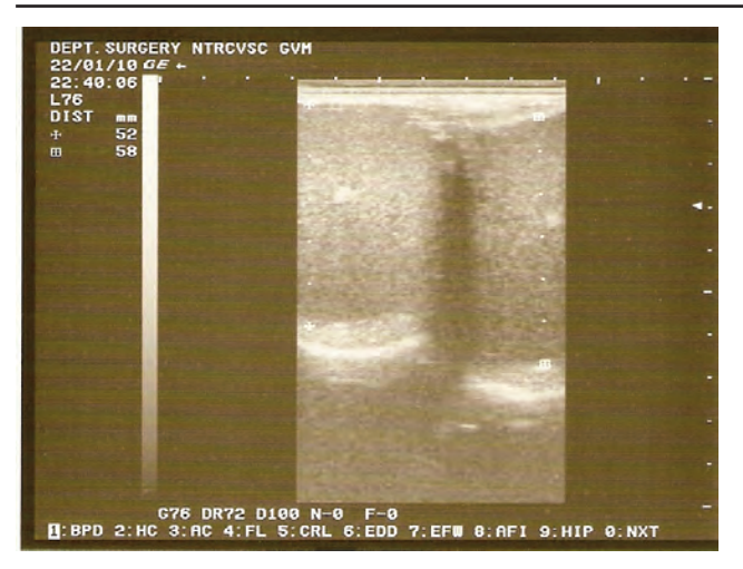
Fig. 2. Ultrasonogram of testis showing mediastinum as a hyperechoic spot at the middle on transverse palne . Note two testicular images together.