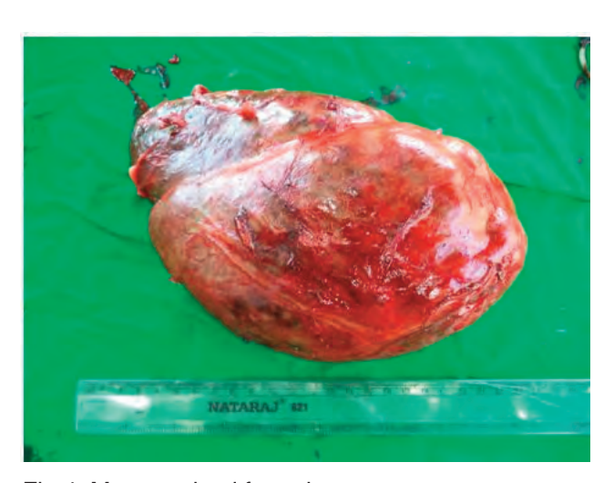
Fig.4. Mass excised from the scrotum.

ride (Xyalxin; Indian Immunologicals) at 0.03 mg/kg BW given intravenously prior to surgery and controlled in right lateral recumbency. The surgical site was locally infiltrated with 2 % lignocaine hydrochloride solution. A 15 cm long incision was made on the swelling at the posterior aspect of neck of scrotum. After incising the skin and subcutaneous tissues, a hard mass was observed which was attached to the outer layers of spermatic cord (Fig. 2). Bleeding points were ligated using chromic catgut no.1. The mass was excised and removed after carefully separating all the attachments with underlying spermatic cord by blunt dissections (Fig. 3). The mass was around 22 cm in length with hard consistency (Fig. 4). A small piece of excised