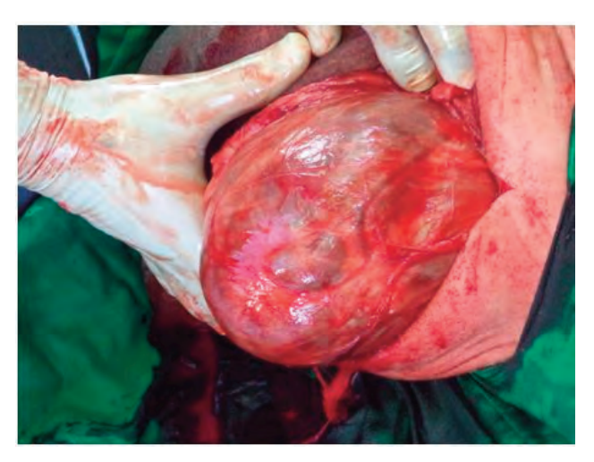
Fig. 2. Hard mass attached to the outer layers of spermatic cord.